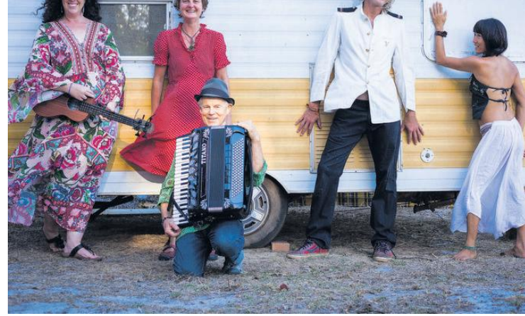
Margaret River gypsy-folk band EnthuZe will launch their new album at Prevelly's Sea Gardens tomorrow evening.

Named after a traditional Maori phrase meaning "with deep affection" - often used when signing off a letter — the album comes